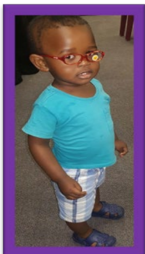
A picture speaks a thousand words!