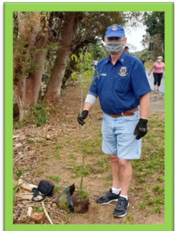
Lions Club of Gonubie

In celebration of Arbor Week, the Lions Club of Port Shepstone joined the Umtentweni Conservancy and Ratepayers on Saturday 4 September to plant indigenous trees along Commercial Road. The bush along the railway line had already been cleared of several invasive species which provided ample space for the planting of 92 trees including from Fluted Milkwood, Giant Pock Ironwood, Forest Mahogany, Forest Fever Berry and White Stinkwood. All the trees planted are indigenous to the Umtentweni area. Sheppie Lions sponsored 20 of the trees and planted several of these, during the morning.