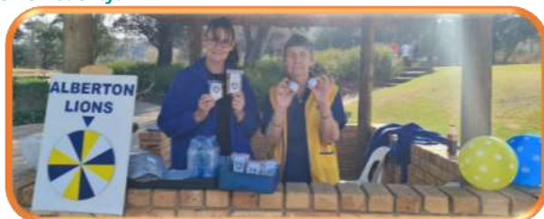
The Lions Club Alberton hosted their popular 9 holes for Hunger fundraiser on the 27 th of July.