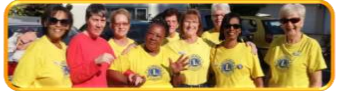
What a fantastic day the Lions Club of Kingsburgh had serving hot dogs to the children.