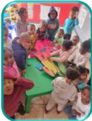
Delivering donated toys, colouring-in books, pencils, crayons to the nursery school in South Hills on the 25 th of July. The teacher was absolutely overwhelmed receiving the donation because the children can now colour in and each have their own colouring-in book.