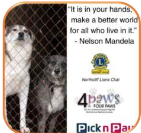
To celebrate Mandela Day, the Lions Club of Northcliff proudly supported 4 Paws Diepsloot with a significant donation. They contributed R3000 worth of dog and cat food, and their partners at PnP Heathway matched their donation with a generous R3000 gift card.