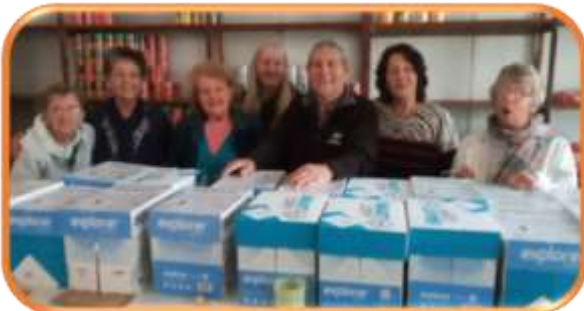
The team of the Lions Club of North Durban worked hard on the 11 th of July packing 78 boxes of food for the residents of Tafta.