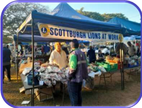
At the "Flea Market" held on Saturday 1 st of July 2023, a Prospective Lion and Service Chairperson were seen testing a wheelchair which was purchased by the Lions Club of Scottburgh from one of the stall holders.