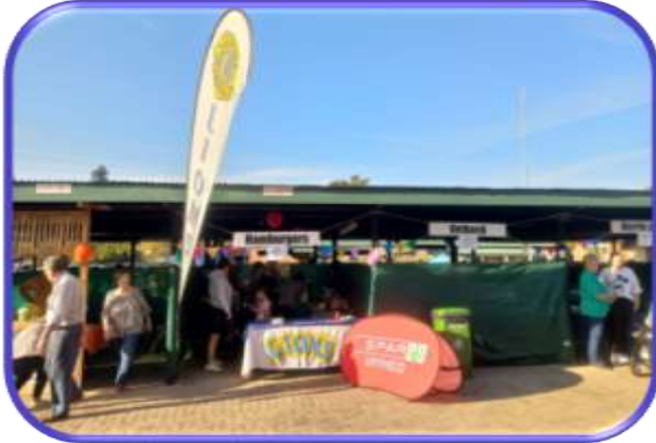
The Lions Club of Vryheid were at the SAVF Bazaar on the 29 th of July raising funds for their various community projects.