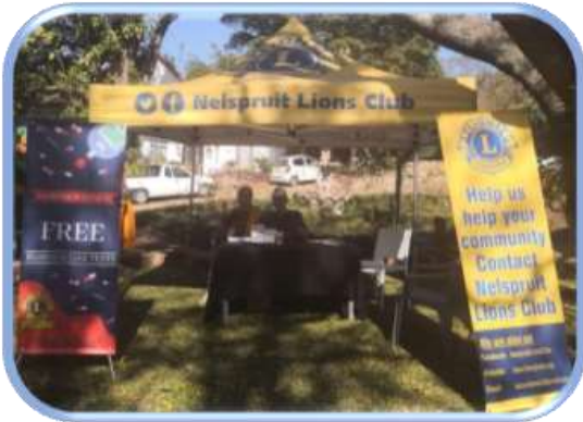
The Lions Club of Nelspruit provided free blood sugar testing at the Honey and Mead festival on the 29 th of July.