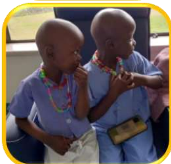
The Lions Club of Cowies Hill weekly visits to the Pediatric Oncology ward continued. On the 5 th of July there were 17 children in the ward. It is such a rewarding project to see these little warriors have some fun.