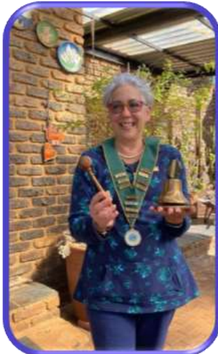
A very unusual, but thoroughly enjoyable, event in that the members and guests travelled from one member's home to another for the different stages of the event and courses of the meal. It was a great experience, travelling from one member's house to another and on to another, for different stages of the event, and different courses of the meal.