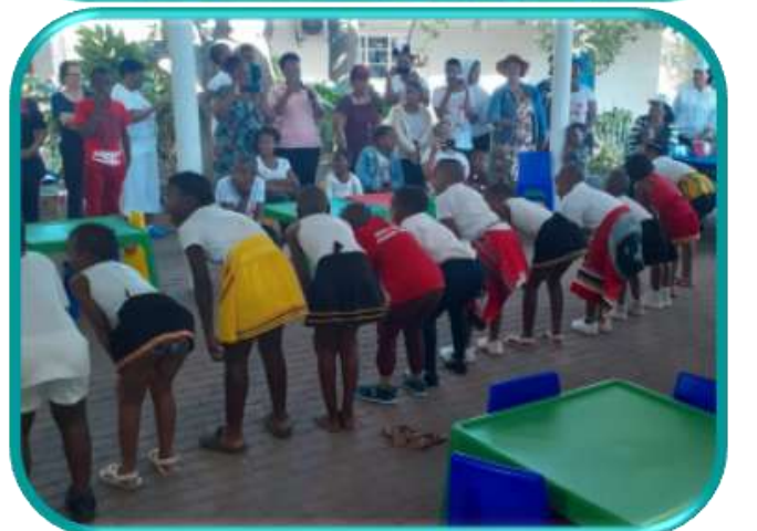
Added to that the joy of watching them singing and dancing and meeting all the other supporters that came on Mandela Day the 18 th of July 2023 to Mother of Peace.