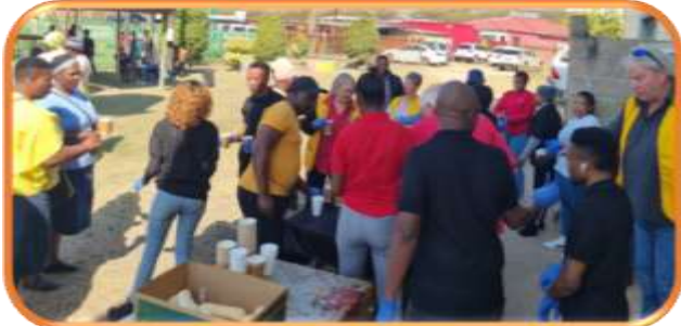
They then fed 148 vulnerable children and adults at a Drop-in Centre run by the Social workers from Childline.