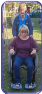
This will be kept in safe storage until someone in need is identified.