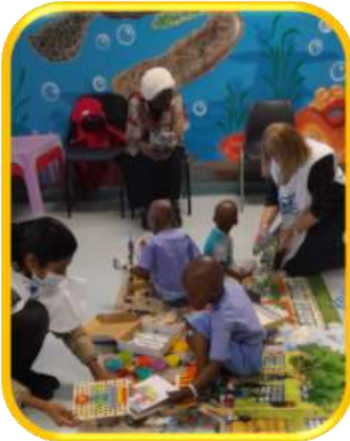
The carpet that was donated to CHOC is the favourite place to play.