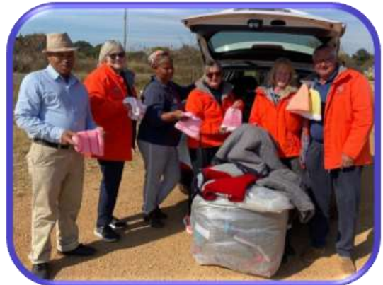
The Blanket & Beanie Drop-off took place on the 7 th of July by the Lions Club of Helderkruijn at the Ikemeleng Village in Wilgespruit.