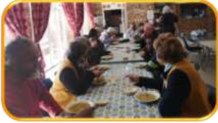
The Lions of Wilro Park were hard at work repairing washlines on Saturday the 22 nd of July at Klein Helderkruijn Retirement Home and the residents were spoilt with a bowl of soup afterwards – Mandela Day 67 Minutes Project.