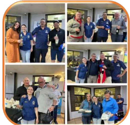
They received tremendous support from companies, the community, and other Lions Clubs towards this wonderful cause.