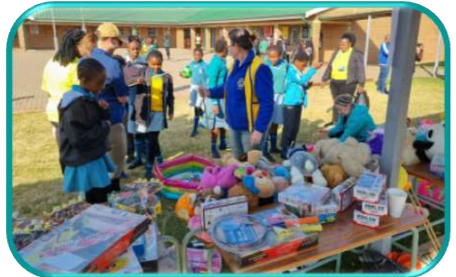
Christmas in July was held on the 29 th of July with 150 learners from 18 different schools coming together to have fun and celebrate Mandela month. The Lions Club of Alberton provided stalls with prizes, sweets and chips, fun activities as well as lunch and a goody bag for each learner. A wonderful project and with grateful thanks to the members, sponsors and community who assisted in making this such an incredibly special day.