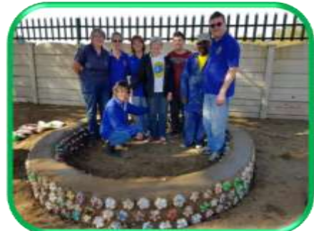
Lessons learnt glue the lids on to the bottles so inquisitive little fingers don't pull the plastic out – the result, the bench is good to go for many more years!