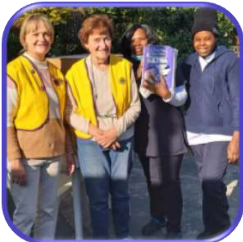
Another Mandela Day project - the Edenvale Hospice Care Centre were extremely happy to receive a donation of nappies by the Lions Club of Edenvale on the 20 th of July.