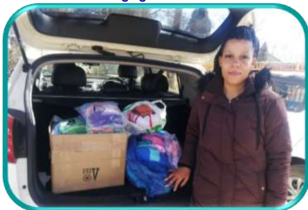
Baby jerseys, beanies and booties were delivered to the Grace Factory on the 31 st of July by the Lions Club of Vereeniging who give a huge thank you to all their dedicated knitters!