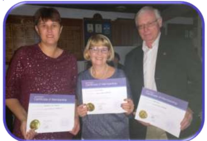
On the same evening as the Presidential Induction, three new members were welcomed and inducted.