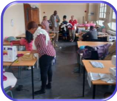
On the 5 th of July the residents from Flame Lily Retirement Home sorted out sewing items they no longer require for donation to the Mariannahill Monastery sewing class.