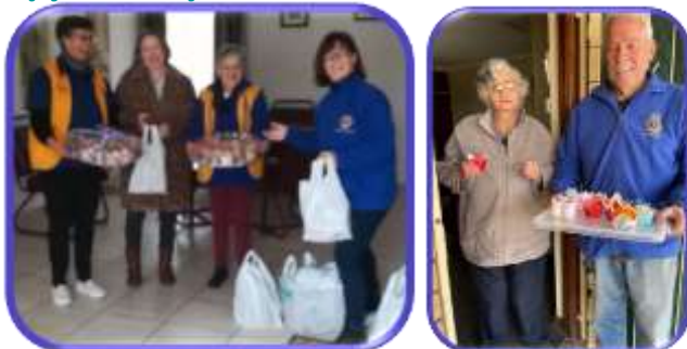
A team from the Lions Club of Alberton delivered care bags to the residents in Dinwiddie on the 14 th of July. What a special day for them and joy for the Lions to serve.