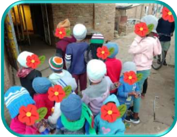
On the 19 th of July the Lions Club of Edenvale Lions gave out beautiful beanies and scarves at the local squatter camp in aid of 67 Minutes for Mandela.