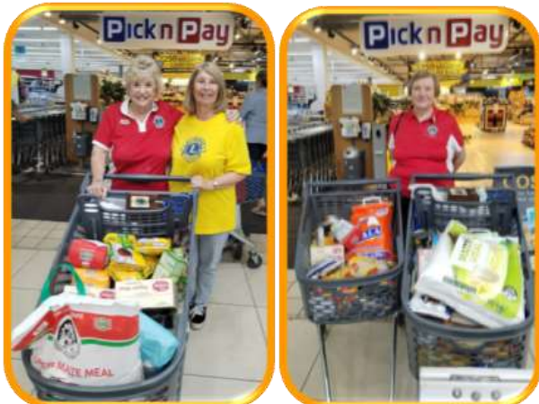
Another successful food collection held on the 29 th of July at Kloof Pnp Field Centre.