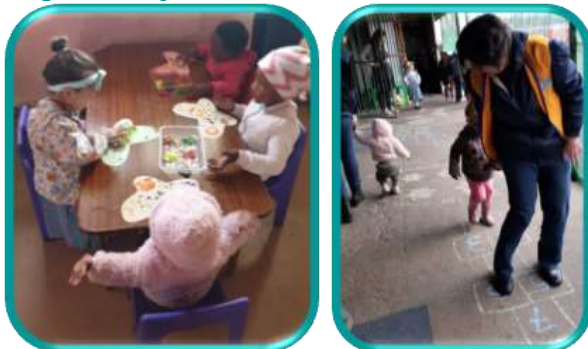
On the 14 th of July, the Lions Club of Alberton held a Sports and Art day at the nursery school in Alberton North. Much fun and enjoyment had by all.