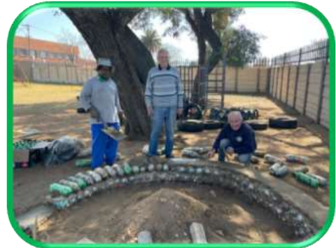
Mandela week environmental project on the 18 th of July. Repairs done by some members of the Lions Club of Alberton to the bench at the nursery school in La Rochelle which needed some TLC.