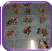
230 pairs of used spectacles were sorted and packed to go to Lions Brightsight on the 8 th of July.