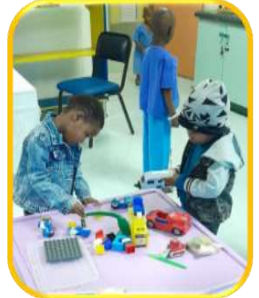
The morning of the 12 th of July was a very noisy morning at Pediatric Oncology ward at Nkosi Albert Luthuli hospital. The children were in great spirits and playing with skittles and then of course the balls got used for kicking around. One little 3-year-old showed the Lions of Cowies Hill such amazing ball skills, a future soccer player, for sure.