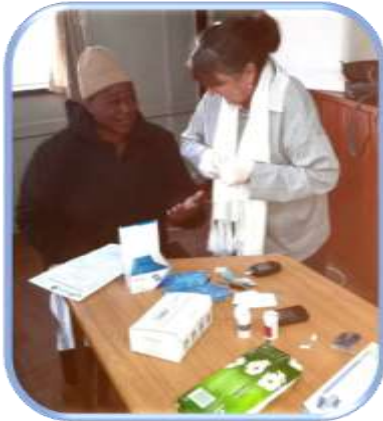
Ligstad hosted the event and assisted with transport - getting some of the elderly folk to the clinic and back home. A big thank you to the supervisors and great UJ students.