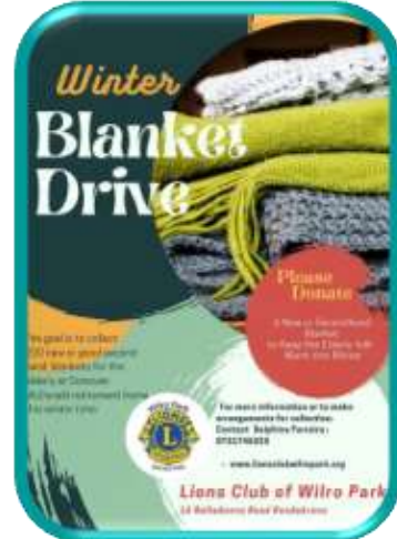
The Lions Club of Wilro Park held a very successful Blanket Drive challenging others to join us to be Winter Warriors! We collected 180 blankets for Donovan McDonald Centre for the aged and then thanks to one of our Corporate donors distributed another 200 blankets to various Homes, creche's and organisations throughout July.