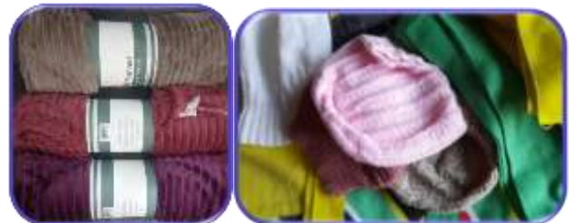
Warm blankets, soft scarves and beautiful beanies were distributed by the Lions Club of Edenvale during the week of 17 th – 21 st July to the homeless.