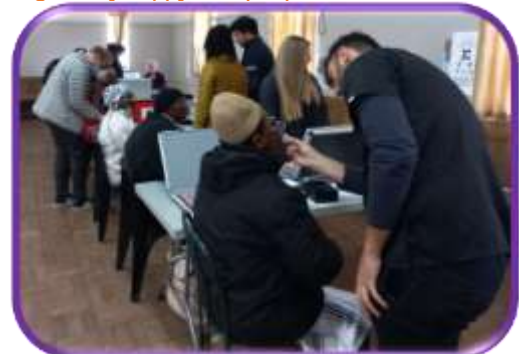
Mandela week Vision and Diabetes Project on the 22 nd of July. Over 80 people from the community had their eyes tested as well as diabetes screening.