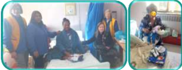
Packing and delivery of Mommy Care Bags to the new Moms at the South Rand Hospital by the Lions Club of Alberton on the 11 th of July. A further 25 mommy care bags was done on the 18 th of July accompanied by Easter Eggs for the staff – a good Mandela Day Project.