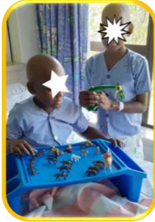
The last visit for July took place on the 26 th of July and proved to be such fun as most of the children were up and about so the playroom was filled with fun and laughter.