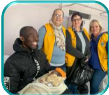
To end the month on the 30 th of July another 25 mommy care bags were delivered to South Rand Hospital – this time a very delighted Daddy was on hand.