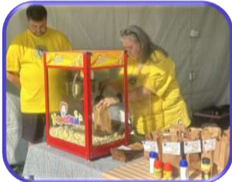
On the 16 th of July the Lions Club of North Durban manned the gates at the exciting Koi Show and provided popcorn to attendees (obviously for purchase)!