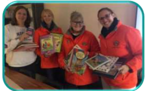
The Lions Club of Helderkruijn recently donated some children's reading books to Baby Moses Sanctuary, along with a donation of a food voucher to assist in feeding the children.