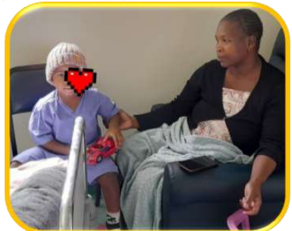
The young boys love cars more than anything else and Lego is still up there with the favourites.