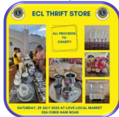
The Lions Club of East Coast once again had their Thrift Store up and running on Saturday the 29 th of July at the Lovelocal Market with all proceeds going to their various community upliftment projects.