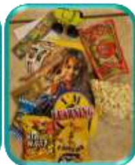
Making a difference in our community, the Lions Club of Alberton donated, packed and delivered court care bags on the 25 th of July.