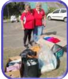
More fabric and other sewing items for Mariannhill Monastery Sewing Group were collected from Flame Lily Ladies on the 9 th of July.

The Lions Club of Cowies Hill handed out Certificates of Appreciation to their various "sponsors".