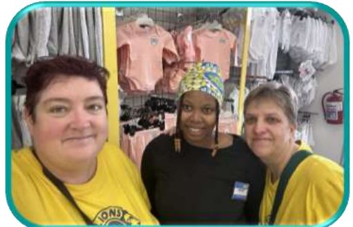
Lions Vicki and Belinda had an amazing morning shopping on the 21 st of July for the Clubs Mandela Day project! Loads of laughs when requesting 40 babygros.