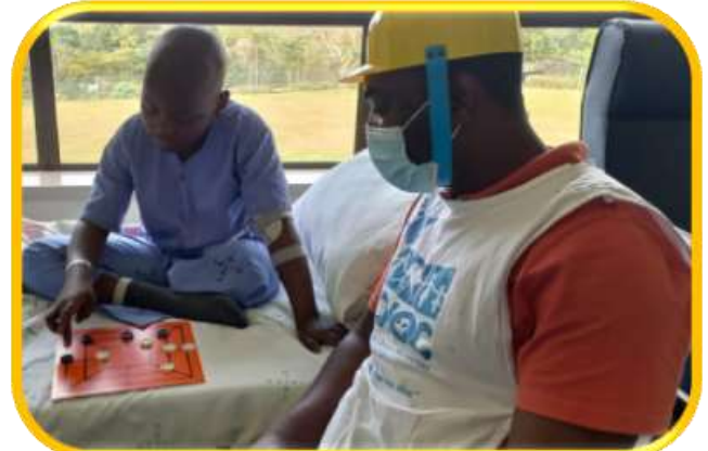
The Lions Club of Cowies Hill visit to the Paediatric Oncology Ward on the 19 th of July was rather heart sore as most of the children were on chemo drips so were unable to come to the playroom. The Lions took toys to the beds and spent time with them there. The new favourite is board games, and they even taught the Lions how to play some of them.