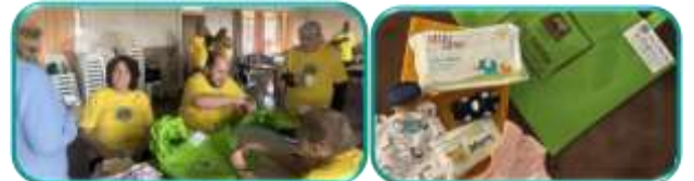
The first Club General Business Meeting of the new fiscal year held on the 22 nd of July was a huge success and culminated in packing baby care bags as part of their Mandela Day Project.