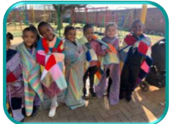
Some of the little ones from Simunye Creche with their blankets.