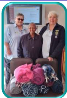
Throughout the month of July, community service was carried out with 9 Blankets to "Gift a Child" in Albertsville.