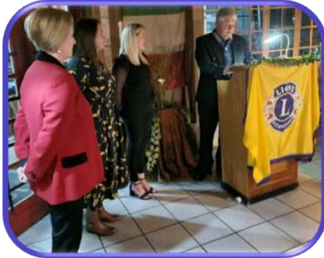
The Lions Club of Henley on Klip were proud to induct two new members on the same occasion.