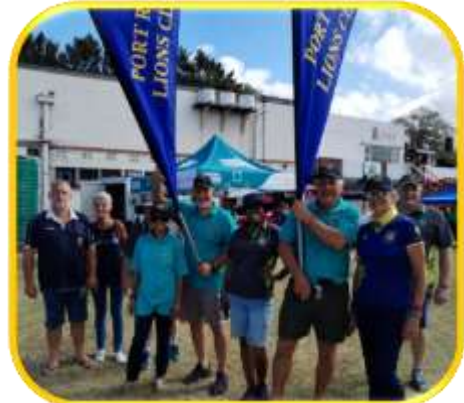
Back to East London to attend the Cancer Relay for Life on 9 th March, which was very well attended and is an annual event in support of all those who are fighting cancer, have survived cancer and sadly in some cases lost the battle to cancer, you are all heroes. Port Rex Lions Club and Gonubie Lions Club each sponsored a stand. The Lions Clubs of King Williams Town, Komga and Port Alfred also joined at their stands. A fun time was had by all.