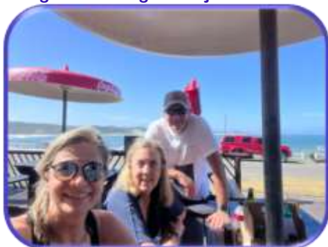
Lunch at the Beach on 7 th March on route to East London – Tough life!