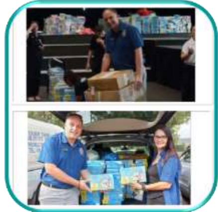
The JHB Mini Councilors collected 192,268 Easter Eggs this year. The eggs were distributed to various charity organisations and Alberton Lions received 4000 Eggs on 21 March. These Easter Eggs will certainly put a smile on many children's faces.