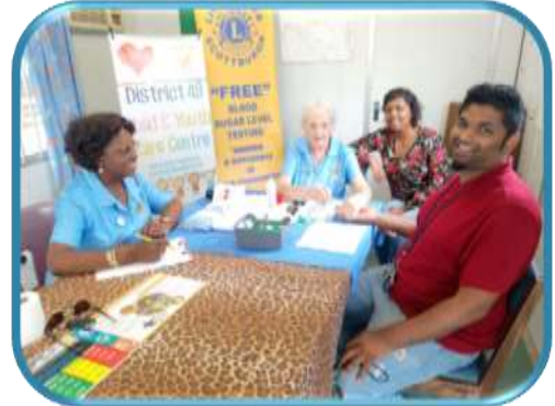
Diabetes Testing was done at District 49 (a place of safety for children) on 13 March - 26 staff and children were tested.

On 21 March the Lions Club of Uitenhage met at the President's home to make up care packages for newborn babies born in the Provincial Hospital as well as their mothers. These care packages consist of a blanket, toy, bib, and a warm hat for the baby. The mothers will receive a face cloth, deodorant, soap and sanitary wear. Forty-two of these packages were made ready for delivery.