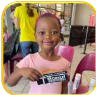
(Photograph published with permission from the Parents)

The Lions Club of Midrand held their very first CANSA Shavathon to promote awareness of Childhood Cancer and create visibility as to the work that they do within the large community of Midrand. Twenty-four people had their hair either shaved or colour sprayed with many other members of the public discussing the Lions Club of Midrand and the various LCI pillars of service with particular reference to Childhood Cancer.