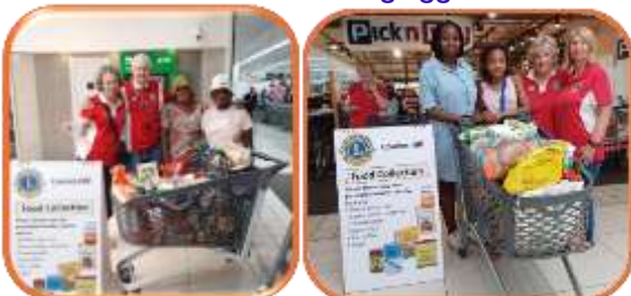
Cowies Hill Lions held a food collection on 2 March at Kloof Pick n Pay Field Centre. They collected 4 trolleys of groceries with the recipients being Kusaselihle Community Development in Molweni, Pinetown Child and Social Welfare and the Salvation Army.