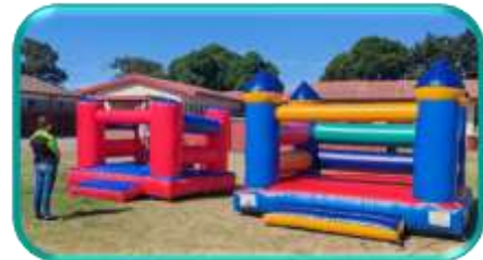
The children were fed and given food to take home.