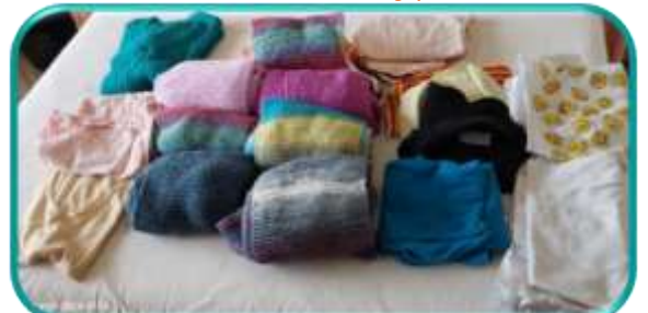
On 18 March the Lions Club of Scottburgh delivered knitted scarves, beanies, and clothes to District 49.