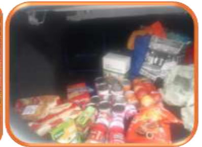
The Lions Club of Scottburgh purchased food and delivered it on 14 March to a needy person.