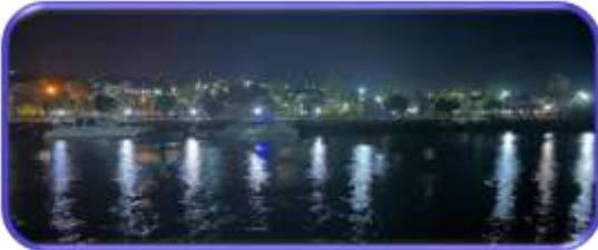
This was followed by a social on Tuesday evening, the 5 th of March. Well-done to Port Alfred Lions for all you do and for embracing our global causes and initiatives.