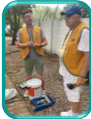
The Paint Team - Wilro Park Lions at work & play at Tandanani on 23 March.