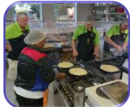
The Lions Club of Uitenhage assisted Lake Farm with a pancake and coffee stall on 9 March. Lake Farm is a home for mentally disabled people. On an annual basis they hold a fun run with quite a few stalls to collect funds for the year ahead.