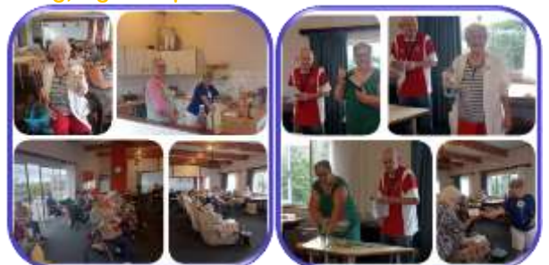
The 200 Club Draw was held at Pinehaven Retirement Home on 8 March with the Lions of Cowies Hill. Residents enjoyed the evening very much and lots of prizes were up grabs.