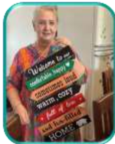
This culminated in a bright & beautiful new wall to welcome guests to this loving children's home. Easter eggs were also delivered for the big Easter egg hunt coming soon!