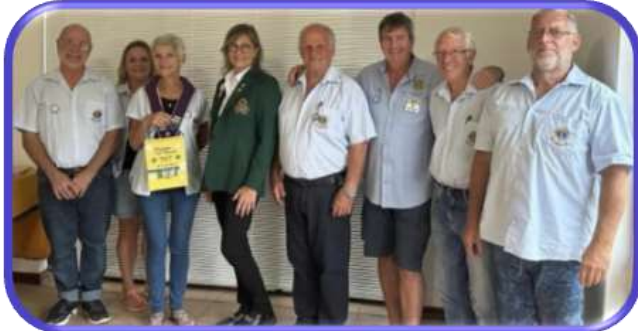
We had a lovely visit to Port Alfred Lions at their GBM on Monday 4 th March.