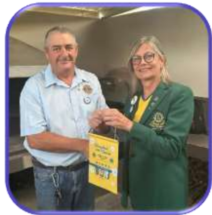
We visited the beautiful Komga on 8 th March. The Lions Club of Komga do some amazing projects in their community. I'm really looking forward to staying in touch and collaborating going forward to see how you put all your plans into action. Mission 1.5 accepted.