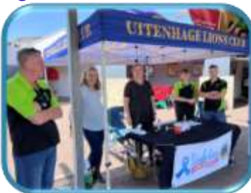
The Lions of Uitenhage were privileged to have the District Governor with them while they were doing the Diabetes Testing Project.