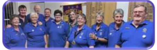
Then on to Thursday evening the 7 th of March, we visited the Lions Club of Gonubie. This is a very busy Club - keep up the good work Gonubie. Thanks for the fellowship and looking forward to your prospective Lion joining soon.