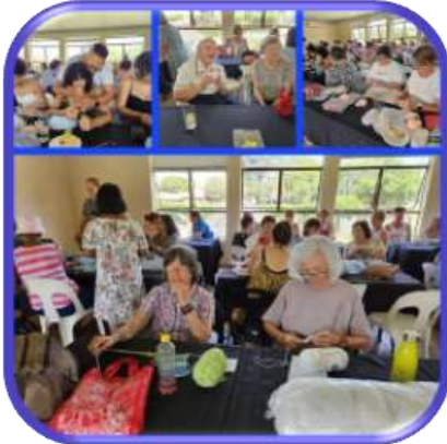
The knitting, crochet and natter event of the Lions Club of Alberton was held on 16 March. Fifty ladies all got together to make new winter items, learn new techniques and ideas, meet new friends and reconnect with old ones.