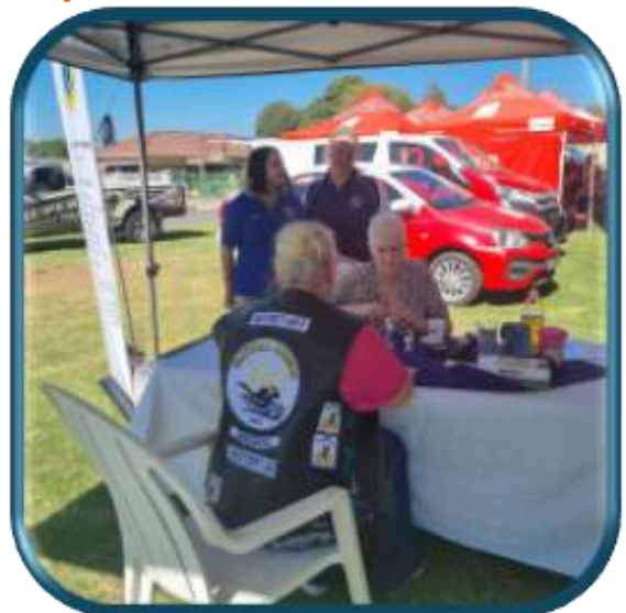
Benoni Host Lions Club held a Diabetes Awareness and Screening Day on 16 March in conjunction with SANBS at Handy Hardware Centre where the public were invited to participate in a one-stop health check day. 39 Tests were done on the day.