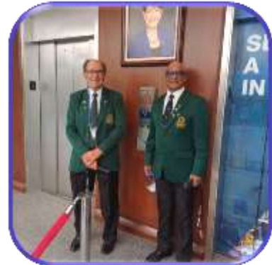
Looking very smart and learned! 😊