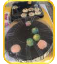
On 24 February, whilst some Benoni Lions Club Members joined the Zone 3 Walk for Little Warriors in aid CHOC, others manned the stall at the Bunny Park in Benoni and sold cupcakes.