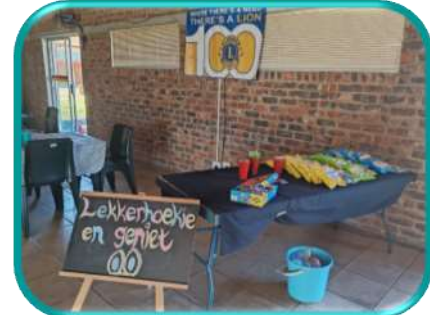
Sonop Paashaas Project held on 16 March where the Lions Club of Uitenhage gave it an Easter theme and spoiled underprivileged children as well playing games with them.