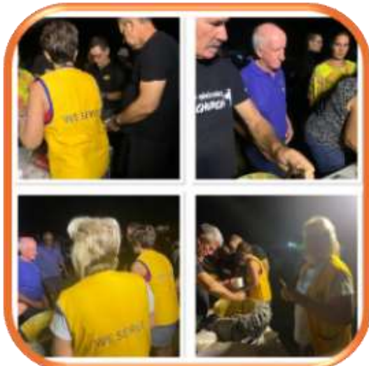
On the evening of 21 March, the Lions Club of Alberton once again assisted the Fish and Bread Ministry in feeding more than 120 homeless and very hungry people.