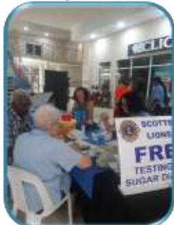
The Lions Club of Scottburgh held their Diabetes Testing at the Scottburgh Mall on the morning of 5 March with 2 potential Lions.