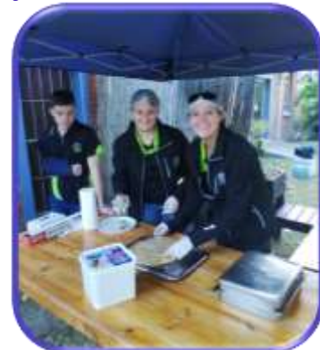
The Uitenhage Lions were hard at work to assist them in raising these much-needed funds.