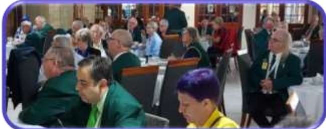
The morning of Friday 3 May dawned bright and early with the Past District Governors Breakfast.