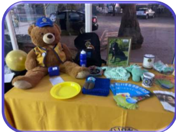
The promotion of Lions Projects was displayed in the foyer, which gave attendees an insight into the work that the Lions organisation does in their communities.