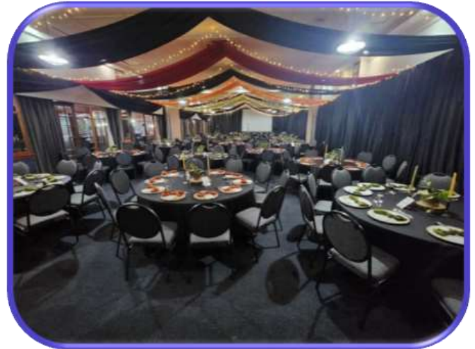
Set up of the banquet venue done by the hardworking Convention Team, waiting for the guests in the finery.