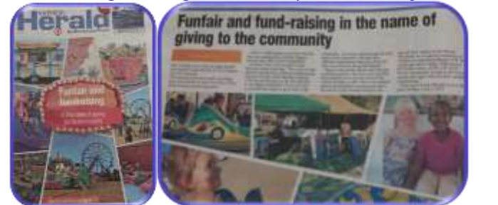
The MayFair is the biggest fundraiser of the year, which is an initiative that assists them in giving back to the community as all the funds raised are ploughed directly back to the community. The little ones had their faces painted and everyone browsed the variety of stalls on offer. There was laughter galore, and delighted screams punctuated the action.