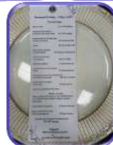
Elegant table set up