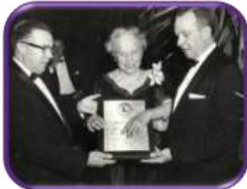
Taken in 1961, Helen Keller receives a special Lions Award

She had no idea just how far the Lions Association would take her challenge. Before the Convention was over, the Association unreservedly dedicated itself to making Helen Keller's dream a reality. Lions would become Helen Keller's Knights of the Blind.