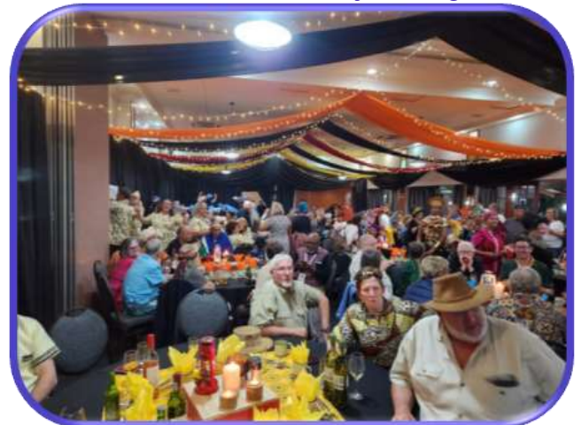
Let the party begin – when in Africa!