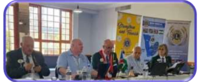
And then the business of the Multiple District 410 begins with the Council Meeting on the morning of 2 May 2024. It all looks extremely serious.