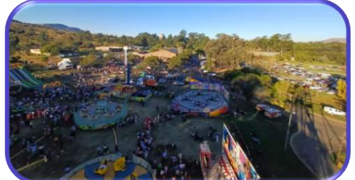
Vryheid Lions Club's Annual MayFair 2024 took place on 3 and 4 May 2024 at Cecil Emmet. What a busy weekend they had, with approximately 15,000 feet through the gate over the 2 days, the biggest success since the Covid-19 pandemic.