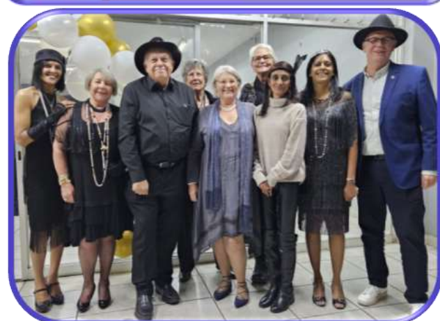
A very successful Lions Club Branch of Lenasia Dinner Dance was held on 25 May 2024.