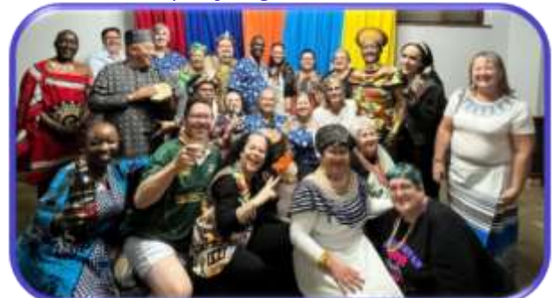
The 2024 RLLI Team