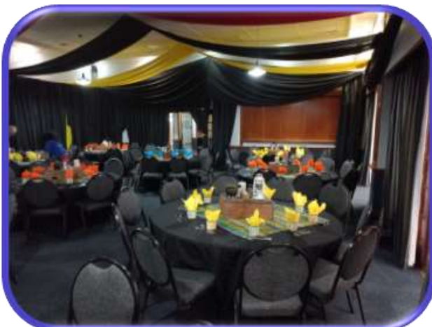
The fastest turnaround ever of a venue by the Convention Team. Set up for the Theme Evening after the MD410 Convention finished late!