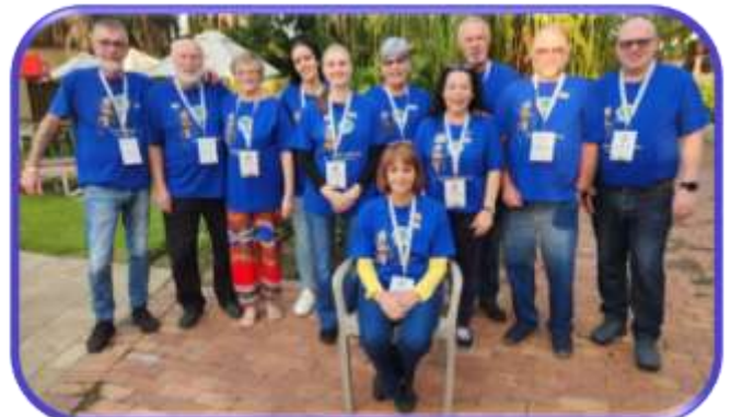
The MD410 Ubuntu Convention Team who made it all happen – thank you.