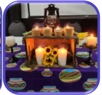
Table Décor - absolutely stunning.