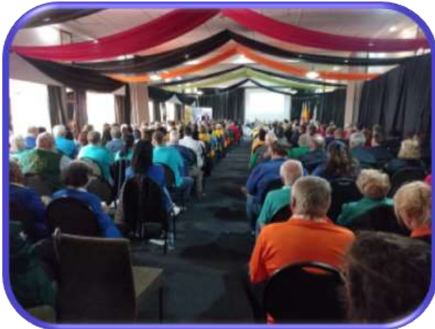
Back to business – the Multiple District 410 Convention held on Saturday 4 May 2024.