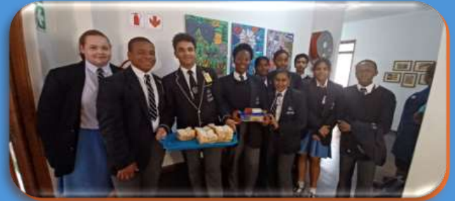
On 16 August, the Young Leos of Scottburgh made sandwiches and distributed them to needy children at Scottburgh High School.