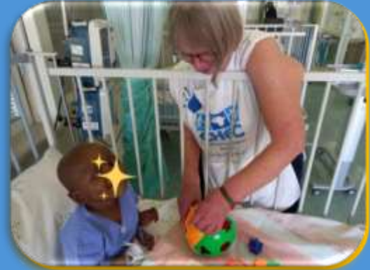
A huge mixture of emotions was experienced on 31 July as one little girl who has been in the Ward for months was really not very well which was heartbreaking, however 2 of the children that to date had been unable to walk were well on their way to utilizing their legs with one walking albeit with assistance.