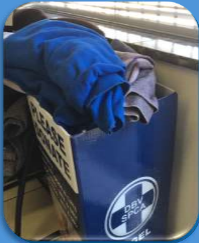
Blankets collected and designated for the Benoni SPCA, ensuring that our furry friends are warm.