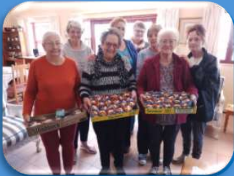
On 8 August the Lions donated cupcakes and desserts to the ladies at Lions Haven to celebrate National Women's Day.