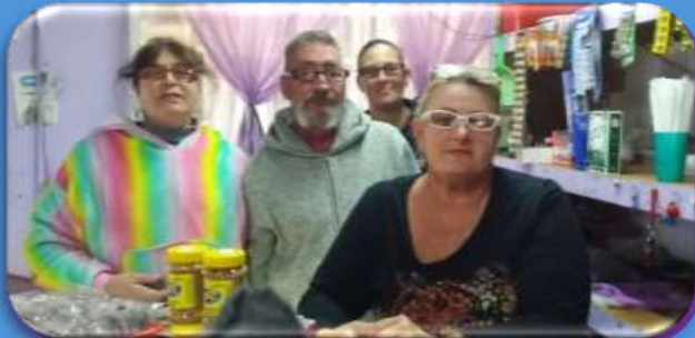
Ensuring that the gift of sight is given by donating Readers to those that require them in the community.