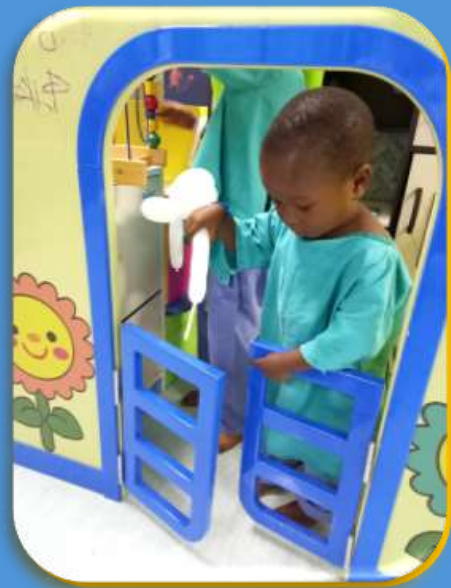
When a volunteer does the training on the “do’s and don’ts” of visiting the Pediatric Oncology Ward, one of the things they tell a person is not to get emotionally involved with the children. That is so much easier said than done as the Team who visit these previous warriors seeing them once a week, every week for months at a time, can’t help but creep into the Lions hearts.