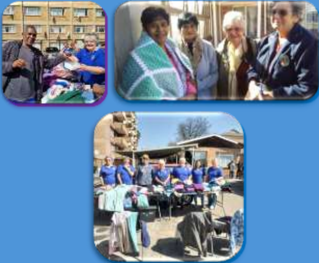
A wonderful day bringing kindness and dignity to those less fortunate.