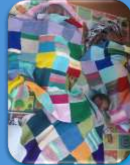
Cowies Hill Lions donated 3 knitted blankets to an unprivileged Creche on 16 August, received from the Edenroc Knitters Group.