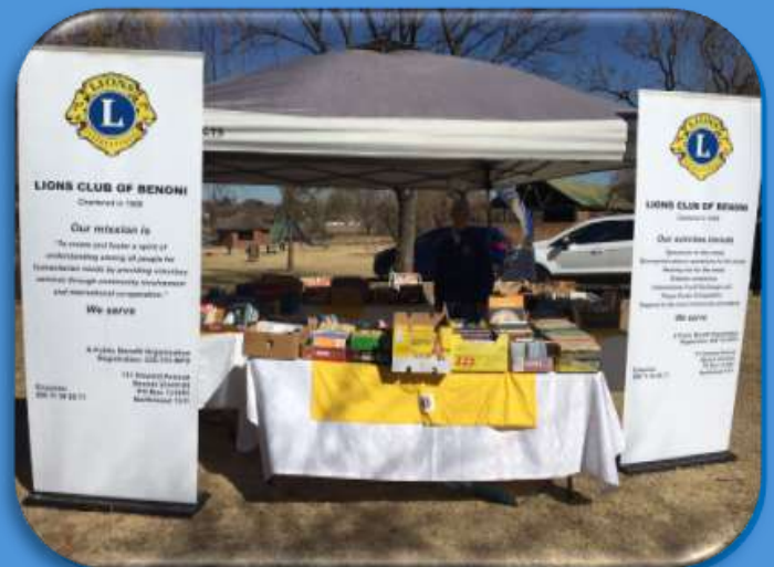
The Lions Club of Benoni held a book sale at the Bokkie Park on 6 July which was one of the coldest days of the year in Gauteng, but nothing deters a Lion!