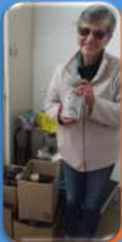
Following the large scale packing of Jars of Hope in June, 35 jars were delivered to All Souls Church to distribute to needy persons.