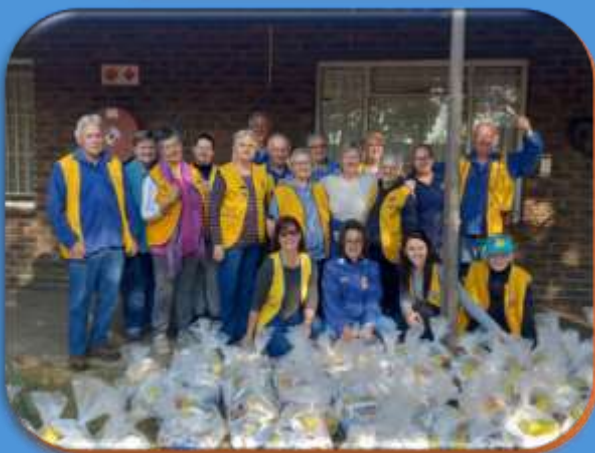
Saturday 3 August, saw the members of the Lions Club of Alberton sponsoring and packing 100 food parcels for their beneficiaries. Making a significant impact in their community.