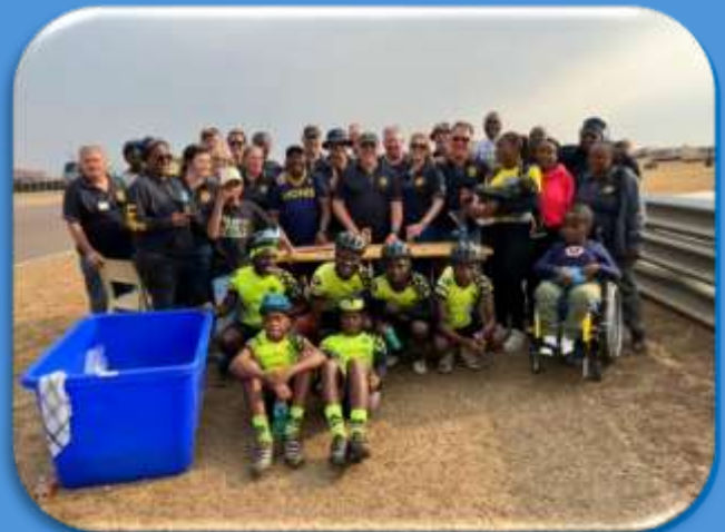
Another successful Cars In The Park on 4 August 2024. The Lions Club of Pretoria South gives a huge round of applause in appreciation to each and every member, partner in service and friend of the Lions in making this fundraising event a success.