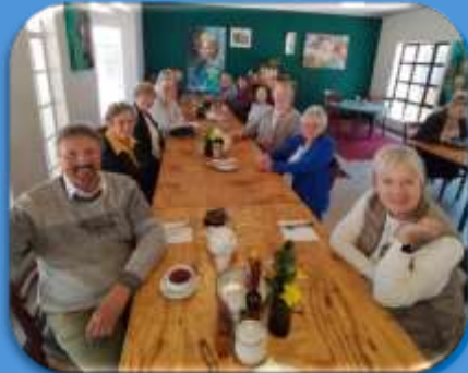
And a celebration of 65 years of Service by the Lions Club of Benoni – chartered on 18 August 1959!