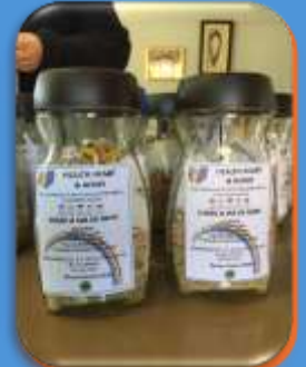
On the 9 th of August (Woman's Day), the Lions Club of Benoni visited the Pauline Davis Court in Benoni delivering reading spectacles, books, Jars of Hope, pre-loved clothing, blankets and scarves for the residents, making their day a little brighter.