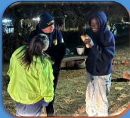
The Lions Club of Pretoria South hosted a very successful “soup & blanket handout” on 16 August. A huge shout out to everyone involved with the preparation and donation of the delicious soups.