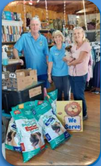
Also on 26 August, food was purchased for “4 Paws & a Tail Scottburgh”, the local Animal Rescue Organisation. The puppy shown in the picture was dumped on 25 August but the story has a happy ending in that the lady in the picture holding the little pup has adopted him, so he has found his forever home!