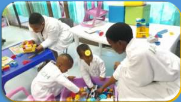
At the visit on 24 July, even the Mommy’s joined in the lego building in the playroom.