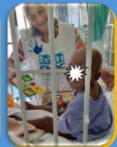
On 21 August the visit to Albert Luthuli Children’s Oncology Ward was a hectic one with the children up and about and in “high gear”, unpacking every toy that the Lions had brought along – much fun had by all including the Lions.