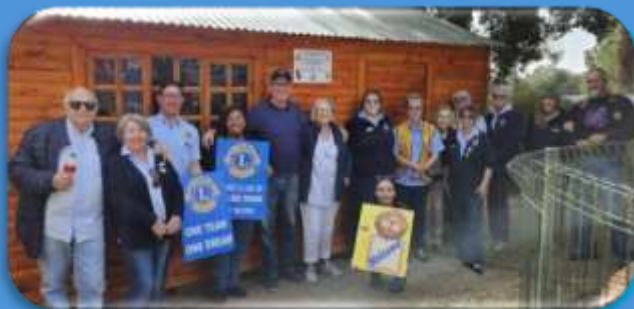
The ongoing project of the Lions Club of Wilro Park – Thandanani. On 27 August saw Lions setting up the Learning Centre, with laptops delivered and functional.