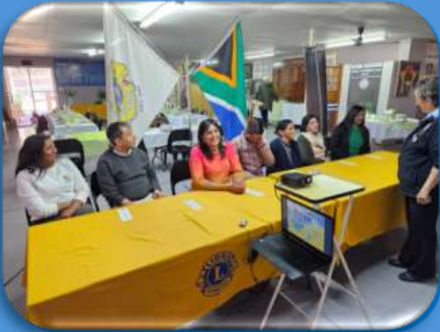
A new member orientation session was held on the same day. A super day was shared with the Lions Club of Wilro Park amidst loads of laughter, good food and excellent company.