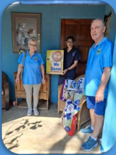
The Lions of Scottburgh do not forget their furry friends with 32 kgs of dog food and 7 kg of cat food delivered on 26 August, to Amanzimtoti SPCA on 26 August.