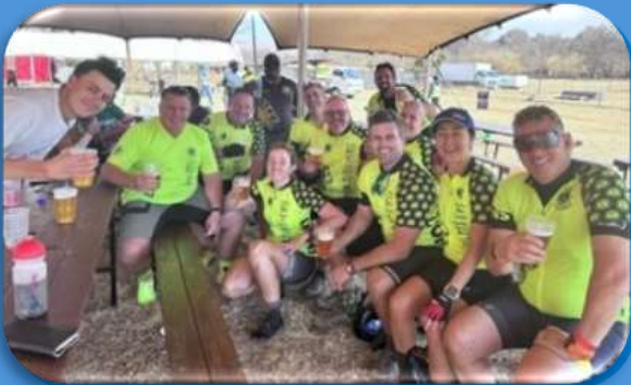
Members and friends of the Lions Club of Pretoria South provided mechanical and motivational support to 1,750 cyclists during the Ford Trailseeker Mountain Bike Race at Van Gaalens Cheese Farm and Trails in Hartebeespoort on 27 July. There was an amazing turnout with over 20 sweepers supporting riders doing the 70, 40, 20 and 10km races. The public and organisers continued to praise and appreciate Lions as these events. Also a great race for the Clubs Academy Riders.