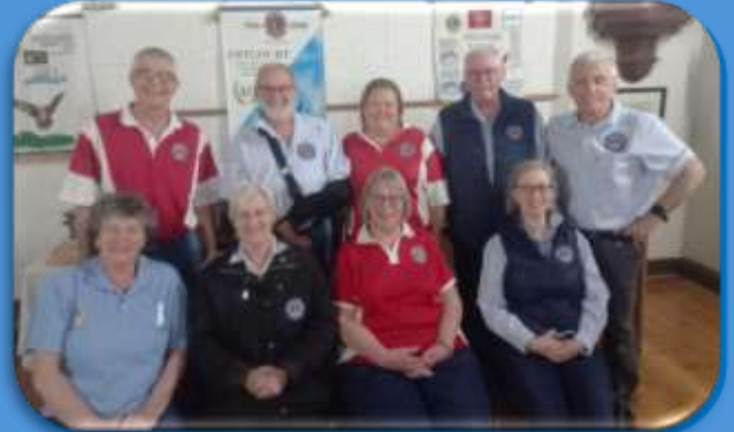
On 24 August saw the Lions of Cowies Hill supporting Estcourt Lions at their 150 Club Draw Fundraiser. Those in attendance had lots of fun and thank the Lions of Estcourt for their hospitality.