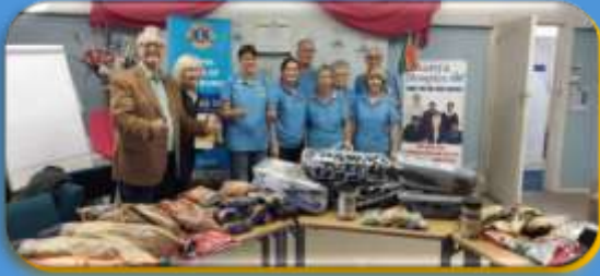
On 15 July, the Lions Club of Scottburgh delivered food and blankets to Hospice. A team of Scottburgh Lions made up 117 Jars of Hope for delivery to the Cancer patients for Mandela Day on 18 July.