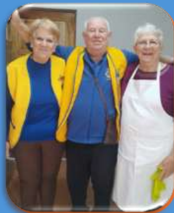
The "Chopping Team" at it again on 8 August assisting the LOTS Team with meal preparation.