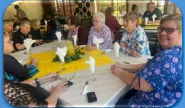
A very special day giving the opportunity to interact with the ladies again, which they appreciated and enjoyed.