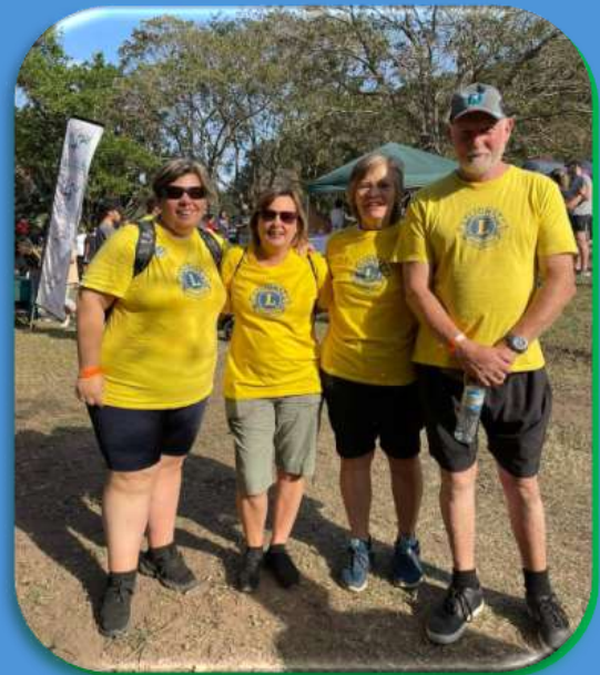
One of Lions International's pillars of service is the Environment, so on 25 August, the members of the Lions Club of Durban South did a 5 kilometre walk and all the funds raised went to one of their favourite beneficiaries being CROW (Centre for Rehabilitation of Wildlife).