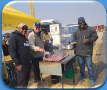
The able bodied “braaiers” ensuring top quality boerie rolls.