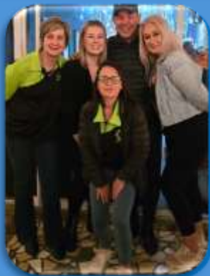
The massive fund raising concert was hosted by the Lions Club of Uitenhage on 3 August. At the concert the Lions had a table for the home by name of Huis Minette which was thoroughly enjoyed by the attendees. All attendees in fact had an absolute blast!