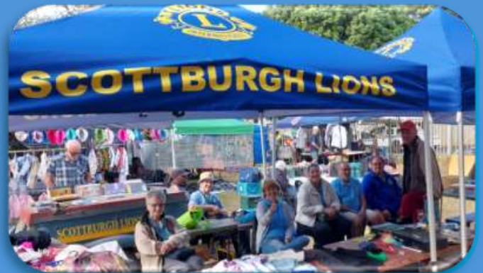
The Lions Club of Scottburgh was at the Flea Market held on the morning of 6 July and 20 July, where they conducted Diabetes Screening of 24 people as well as testing the blood pressure of 27 people, which emanated in 6 referrals. Also gave them the opportunity of showing off their brand new Gazebos!