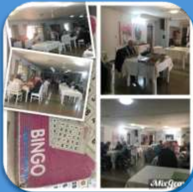
Fun, laughter, chats and Bingo at Fairlands Retirement Home in Benoni on 18 August 2024.