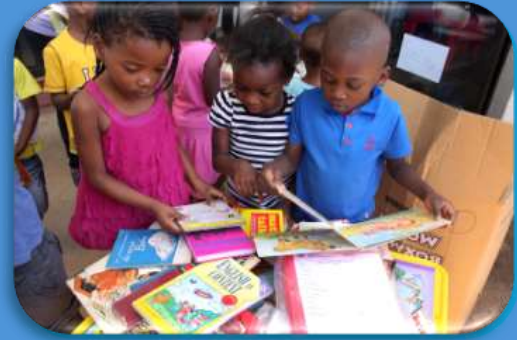
Establishment of a library with books collected, packed and delivered to Hope ECD and the Kgadi Youth Centre in Tembisa on 10 August. A huge thank you for the Study Guides for the older children which will certainly go a long way to assisting them in preparing for upcoming exams.