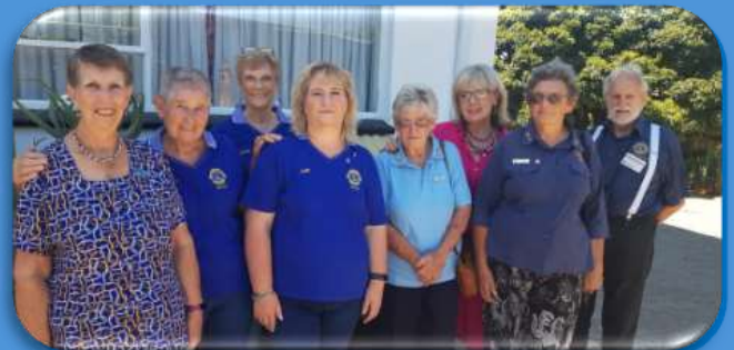
Albeit a very busy few months for the Lions of Benoni they made time with friends to visit Shady Pines Home for Alzheimers and Dementia Patients. Time is priceless!