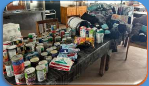
Another day, another act of kindness by the Lions Club of Letaba Tzaneen. On 27 July the members delivered warm blankets and essential groceries to the wonderful residents at Goue Jare Bejaardesorg Modjadjiskloof.