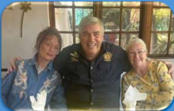
Lions Haven’s 30 Year Anniversary luncheon in Valhalla was prepared and served by the Lions Club of Pretoria South on 17 August.