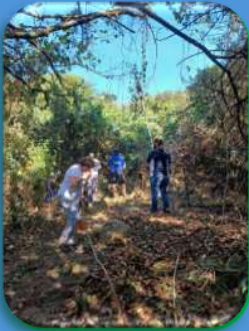
An amazing day was had on 9 August with the cleaning up of the beautiful jungle trail at the Lions Club of Ramsgate's Club House. The trail is now able to be utilised by the community. A superb environmental project.