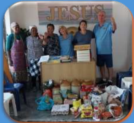
A food delivery to Achor Village, Umzinto, by the Lions Club of Scottburgh was done on 21 August. Achor Village is a place where abandoned women have been given a home.