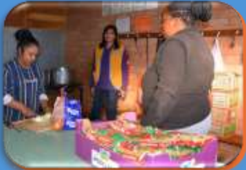
A busy morning was had by the Lions Club Branch of Lenasia preparing meals for lunch for 500 Learners in 67 minutes.