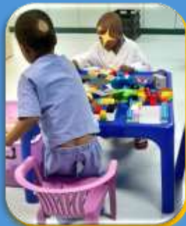
At the beginning one little warrior aged 2 years was terrified of the “white faces”, now on 10 July her little face lights up when seeing the Lions – this makes the project just so worthwhile and rewarding – a little bit of kindness shown to children who should not in their young lives have to suffer this illness.