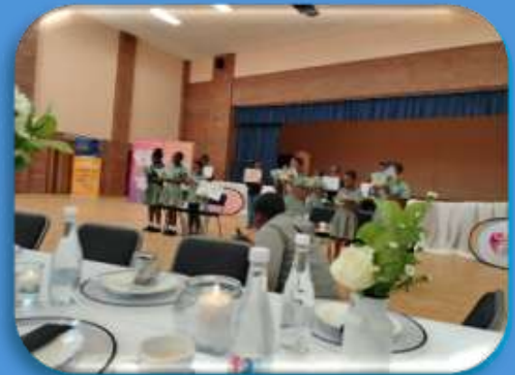
The Lions Club of Benoni were actively involved with the set up and launch of the library at the Chief Albert Luthuli Primary School in Putfontein. Apart from the donation of books to the library they donated a printer as well. Such a joy seeing the children reading at the official launch function.