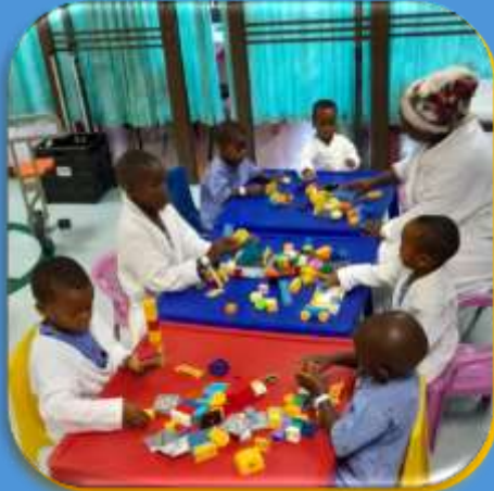
On 3 July - a busy morning with 19 children, Lego was the toy of the day)