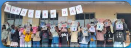
Scarves and beanies were handed out to children at Injobulo Primary School on 18 July in celebration of Mandela Day.